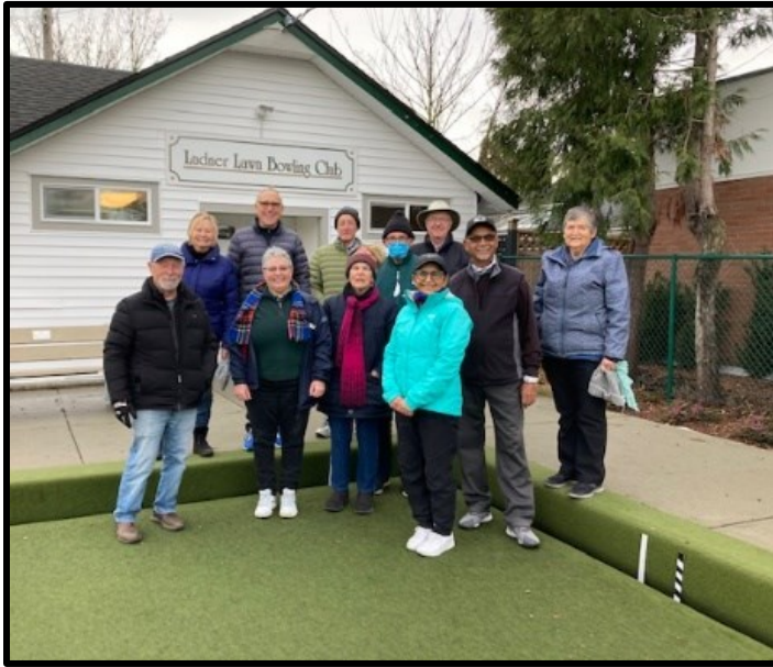
Glad to be out in the fresh air.