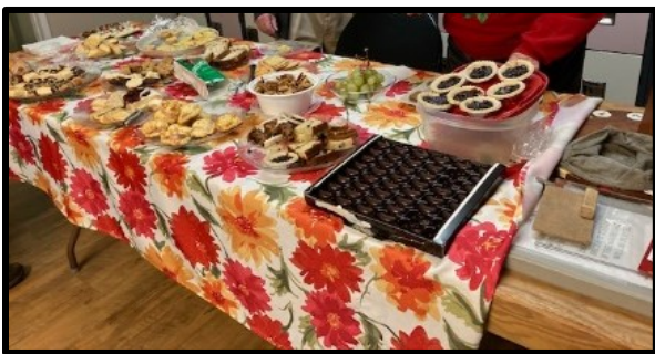
The treats members brought were delicious!

Luck was with us on Boxing Day. The rain washed away the snow, the temperature was pleasant, and the green was in great playing condition.