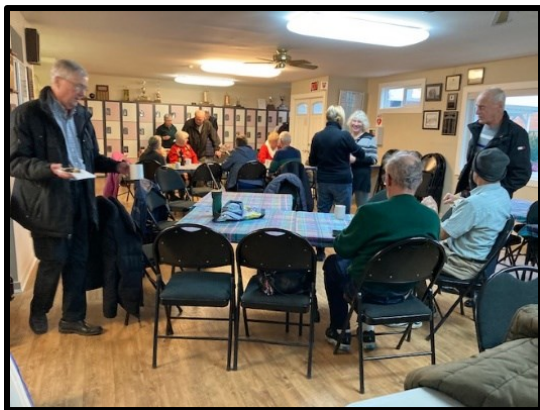
Friends greeting friends.