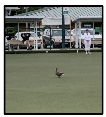
A visitor who came to see what was going on and left after giving its deposit of approval.