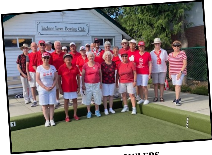
2023 CANADA BOWLERS